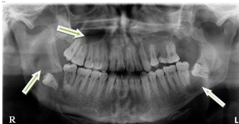
Figure 1: Panoramic view showing multiple radiolucent lesions in the mandible and maxilla (arrows)

of the maxilla. The mandibular lesions were associated with the crown of impacted third molars without any evidence of root resorption (Figure 1).