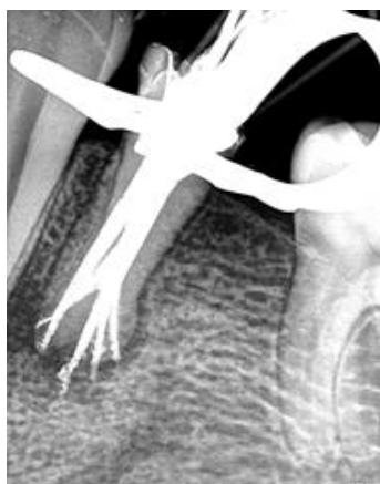
Figure 5: Final radiograph

it seems that false stop during MAF placement was the reason of overfilling of the canals. The patient was referred to a prosthodontist for restorative and prosthetic procedures.