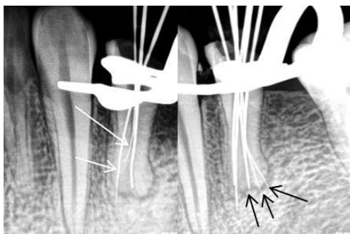
Figure 4: Working length determination radiograph

Since there were multiple canals in such small area,