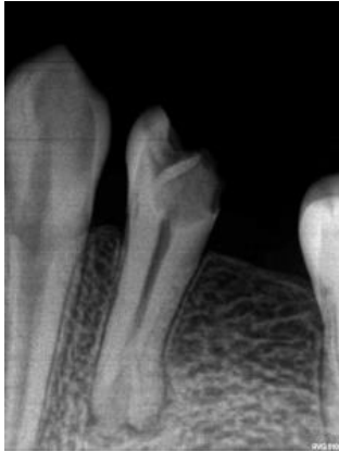
Figure 2: Preoperative diagnostic radiograph

Cone beam computed tomography (CBCT) examinations were administered after informed consent for further evaluation of this rare and complicated root canal anatomy three-dimensionally. CBCT examination of