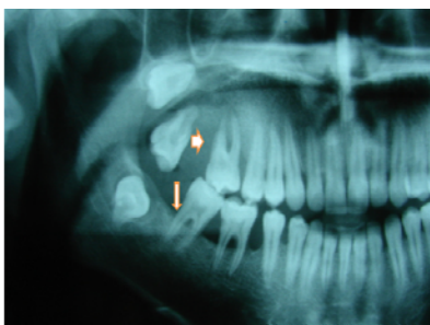
Figure 1 Cropped panoramic radiograph revealed two separate bony defects in the right side of both jaws

A panoramic radiograph revealed two separate bony defects in the right side of both jaws (Figure 1). There was severe bone destruction with a ground glass pattern and “hanging in air” molar teeth with significant displacement of the second molar in the right upper quadrant. However, the inferior border of the maxillary sinus was visible and intact. The right mandible showed significant bone loss with furcation involvement around the mandibular first and second molars as well as the distal aspect of the second premolar. Follicular spaces of the third molars in both quadrants were within normal limits.