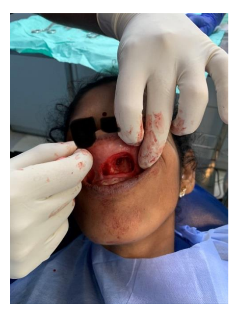
Figure 7: After excision showing the defect area

Nasolabial cyst is purely a soft tissue nonodontogenic cyst though it has been classified under jaw cysts. It is also termed as the mucoid cyst of nose, nasal cyst and s-