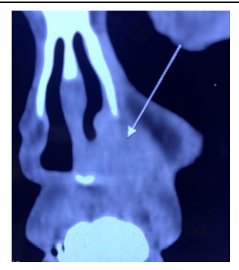
Figure 2: CT coronal view