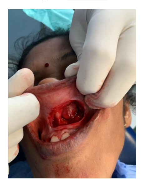
Figure 5: Exposed lesion with capsule