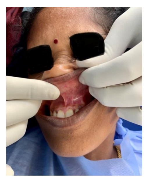
Figure 1: Intraoral view of lesion

A computerized tomographic (CT) scan revealed a well-defined round soft tissue lesion in the lateral pyriform aperture (Figures 2 and 3).