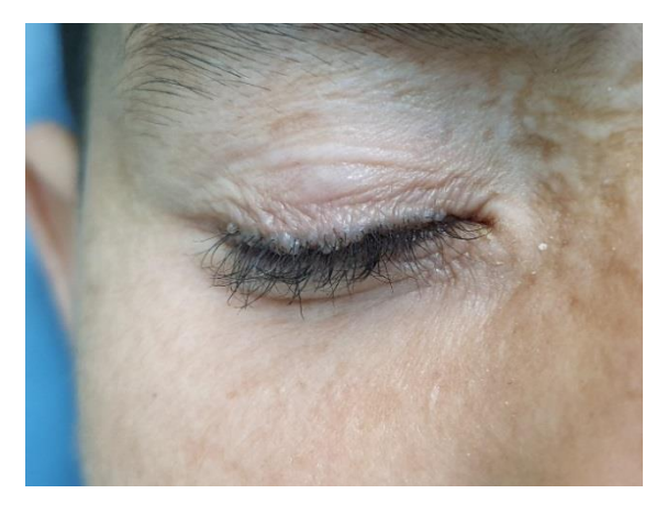
Figure 3: Moniliform blepharosis (multiple, beaded papules along the eyelash line)

However, on examination of the temporomandibular joints, no abnormality was present. The joints were auscultated during mandibular motion and no crepitus or clicking was present. Palpation of the masticatory muscles revealed no tenderness. This suggested the reduced skin elasticity as a major reason for the restricted mouth opening. An enlarged, yellowish tongue with irregular pearly white infiltrations was another feature noted. His tongue had a hard consistency and the lingual frenum was thick, short and indurated, which limited its movement. He could not protrude his tongue beyond his lip margins. Severe ulceration of tip of the tongue was noted as a result of sensitivity to mild trauma. On palpation, both buccal and labial mucosa were firm and multiple nodules were felt (Figure 5). Oral mucosa was dry