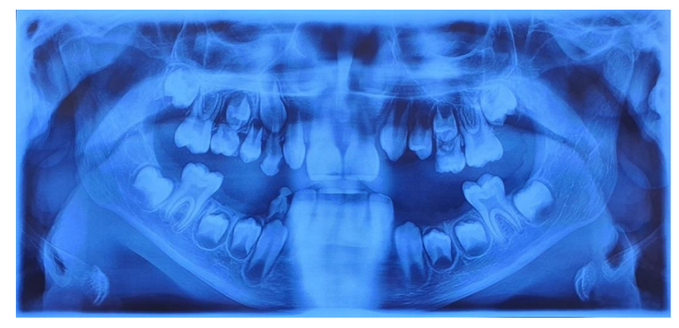
Figure 6: Panoramic radiograph reveals missing of upper left lateral incisor and no other pathological lesion

were extracted due to extensive caries, also the upper second deciduous molar was extracted in order to facilitate mesial movement of first permanent molar and achieve a class II occlusion without spacing. Follow up appointments were scheduled to assess tooth movement and ultimately align and reshape the permanent canine as a lateral incisor. Four lower incisors and three upper incisors were caries free. The remaining deciduous teeth had been extracted earlier due to severe pain. As for the dry mouth, some practices were advised to alleviate symptoms, such as staying hydrated by ensuring adequate fluid intake by using a straw to drink, chewing sugar-free gum, or sucking on hard sugar-free candy to increase saliva production and sipping on liquids throughout the day to keep the mouth moist. If these practices failed to alleviate symptoms of dry mouth, the patient was advised to swish a small amount of liquid saliva substitute for 30 seconds (exactly as directed on the label), then spit it out. This procedure should be repeated 3 to 5 times per day. This also can be done when the mouth feels dry and uncomfortable. Furthermore, a proper oral hygiene regimen was initiated. Patient was referred to a maxillofacial surgeon for the treatment and management of ankyloglossia. He was also referred to a dermatologist for skin lesions and an ENT specialist for the hoarseness of voice and assessment of the stated hearing loss.