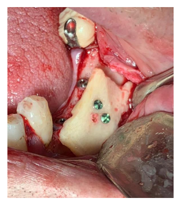
Figure 1: Clinical view of implant site after fixation of lateral ramus block bone graft

the recipient site was perforated using drills under saline irrigation to ensure vascularization of the bone block. The bone block was re-contoured using a diamond bur and adapted to the recipient site. It was fixed to the residual ridge with fixation miniscrews (Jeil, Seoul, Republic of Korea). The fixation of the bone block was performed after implant placement in the group 1 (Figure 1). The gaps between the recipient site and the bone blocks were filled with bone substitute material (Cerabone®), and a membrane (Jason®) covered the grafting site (Figure 2). Tension-free closure of the flap was performed with interrupted sutures. The patients were instructed to use postoperative antibiotics (amoxicillin 500 mg/8 h or clindamycin 300 mg/8 h if allergic to penicillin) and 0.2% chlorhexidine mouthwash for seven days.