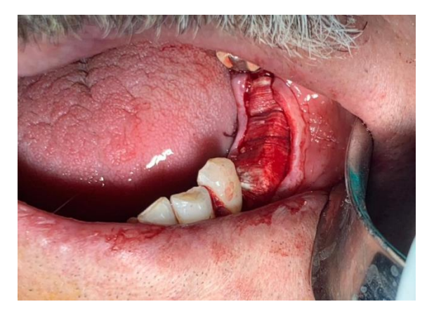
Figure 2: Clinical view of implant site after membrane placement