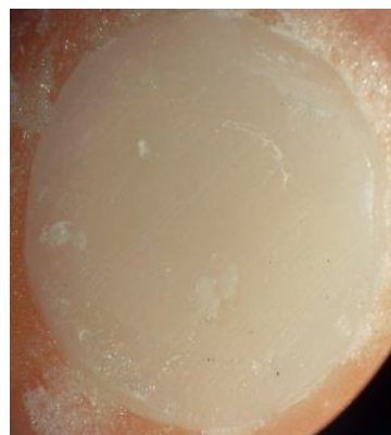
Figure 2: Mixed failure mode

Table 2 shows the mean SBS of three groups. The results (Table 2) showed that the SBS of the new to old composite was minimum in group 3 and maximum in group 1 (control) (Figure2). The SBS of the three groups was significantly different (p<0.05, Table 3).