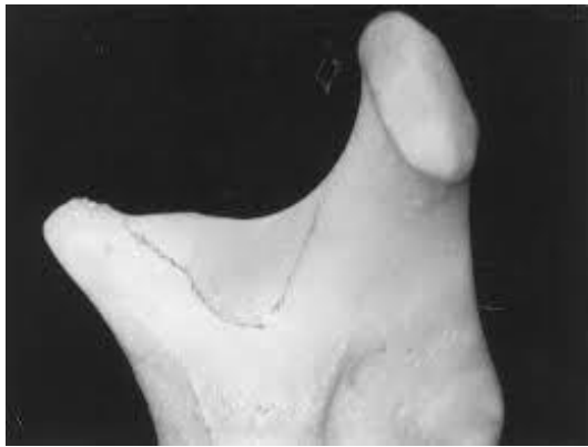
Figure 1: Medial depression of the mandibular ramus (MDMR) was shown by black line [7]

sple activity, which can increase the potential relapse in orthognatic surgery [6].