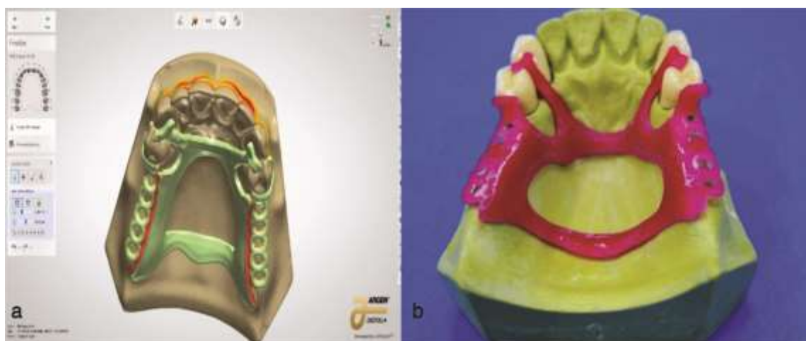
Figure 3a: Final CAD design of High performance PEEK framework. b: Tentative resin frameworks constructed by rapid prototyping technique

The fitting of the ten 3D printed resin frameworks on the epoxy model were assessed and then the master model was duplicated into ten refractory cast to be used during the construction of the RPDs frameworks. Each printed resin frameworks was adapted to a refractory cast and the sprues were connected to it to act as a path of the melting BioHPP. Then, it was invested in a speci-