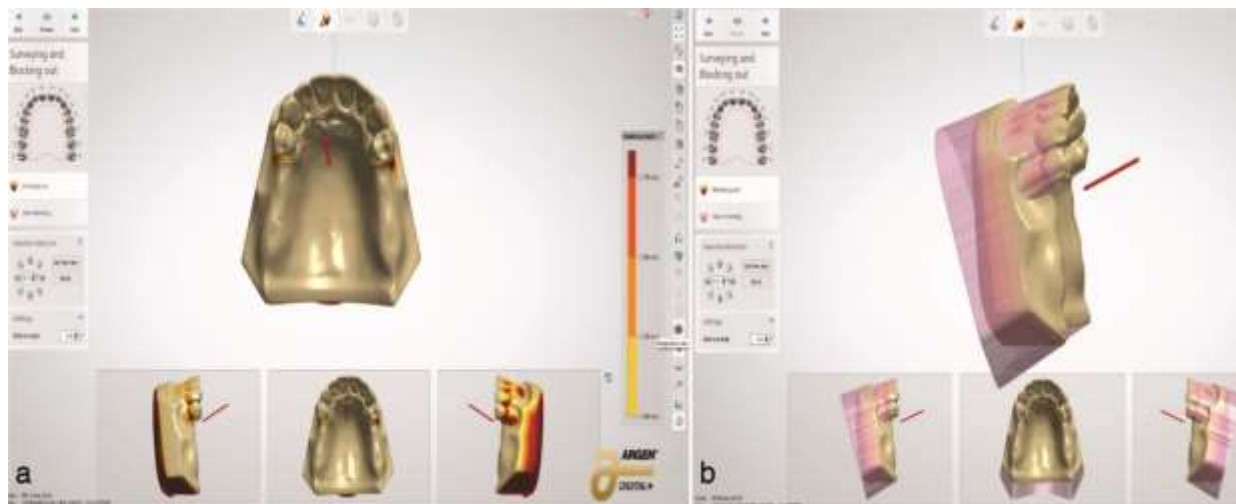
Figure 2a: Surveying of 3D virtual model by digital surveyor to determine the path of insertion and removal, undesirable undercut marked by red color, b: Blocking out the undesirable undercut

ell tool to form 2mm thickness in outside direction. All the angles were smoothed and borders were carved to adjust the antero-posterior palatal bars. The whole framework design was virtually checked from all surfaces. The tentative resin frameworks were constructed by utilizing rapid prototyping technique to examine the accuracy of the frameworks adaptation to the epoxy master model of the study (Figure 3b).