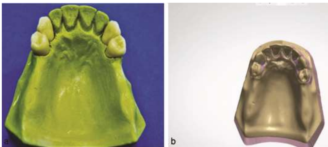
Figure 1a: Epoxy resin study model with porcelain crowns cemented over prepared abutment teeth. b: 3D virtual model exported as STL file format

The width and thickness of all parts were converting into a solid volume. The surfaces were thickened by sh-