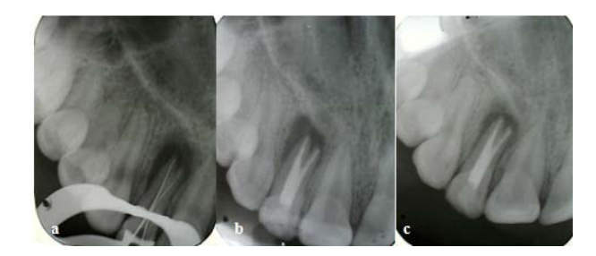
Figure 3: a: Working length determination X-ray b: Post obturation radiograph c: Six months follow-up radiograph

The 6-month follow-up examination of the patient revealed no clinical abnormalities. The tooth was completely asymptomatic and did not show any sign of mobility. The recall radiograph showed moderate bone formation in the periapical region (Figure 3c).