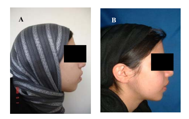
Figure 2-A An 18-year old female view demonstrates retrognathic mandible B Postoperation view after advancement genioplasty

In group 2 with advancement \geq 7mm, hard tissue pogonion relapse of 1.16 mm with a SD 0.46 mm, soft tissue pogonion relapse was 1.8 mm with a SD of 0.68mm (Table 1). There was no significant difference between the two groups (p = 0.53). Also, in comparison of the soft tissue pogonion in the two groups, no significant difference was observed between the two groups (p = 0.38).