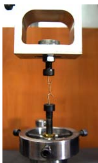
Figure 3 The coil spring is placed on the universal testing-machine's cross heads.

A caliper with the measurement accuracy of 0.01 mm (Hygeia Dental Co. Ltd; Hong Kong) was used to measure the distance between the two hooks and the amount of coil springs activation. After placement of the coil springs on the hooks, the distance between the hooks were measured again and any corrections in the distance were implemented. Then the samples were subjected to thermocycling in 1000 cycles from 5°C to 55°C. The springs were immersed in cooling and heating bath for 1 minute consecutively with 2±1 seconds interval time between the immersions in which they were kept out of the bath at air temperature. At the end of thermocycling, the samples were tested immediately by the machine and the data were recorded. The purpose of this step was to evaluate the effects of temperature variations; in which occurs in the mouth, on NiTi coil springs unloading forces.