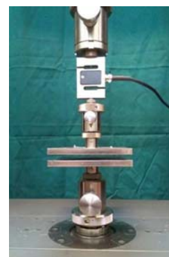
Figure 2: Universal testing machine for testing the compressive strength of the samples

To test the compressive strength, we placed the samples lengthwise between the platens of a universal testing machine (Zwick Roell Group; Germany) (Figure 2).