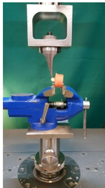
Figure 1: A sample in universal testing machine

Table 1 demonstrates the mean and standard deviation