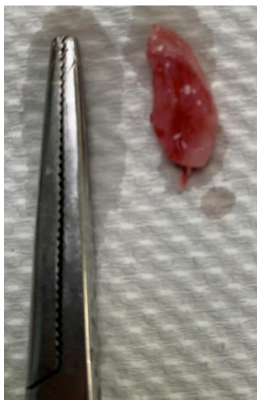
Figure 8: Excised specimen