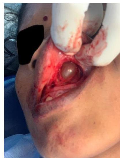
Figure 6: Capsule opened to expose the lesion