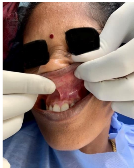
Figure 1: Intraoral view of lesion

A computerized tomographic (CT) scan revealed a well-defined round soft tissue lesion in the lateral pyriform aperture (Figures 2 and 3).