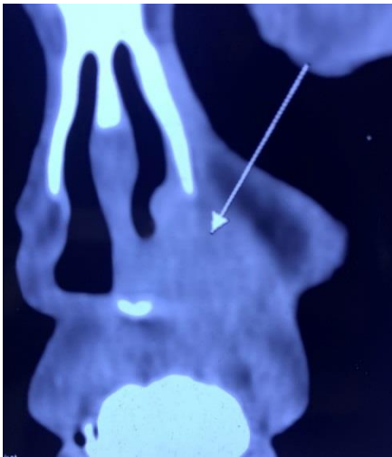
Figure 2: CT coronal view