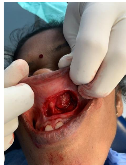
Figure 5: Exposed lesion with capsule